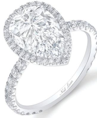
Neil Lane 3 Carat pear shaped engagement ring with halo setting.

The 3-carat pear-shape diamond in a halo setting Bryan Abasolo gave Rachel Lindsay is so special. Let's hear about that jewel.