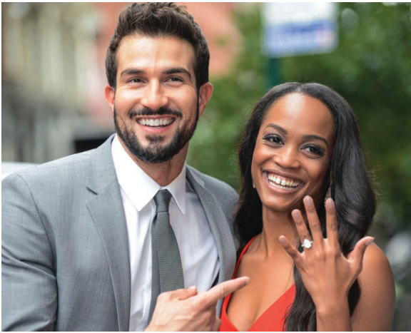
Bryan Abasolo (L) and Rachel Lindsay outside of AOL Studios in New York City.