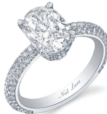
Neil Lane oval diamond engagement ring.