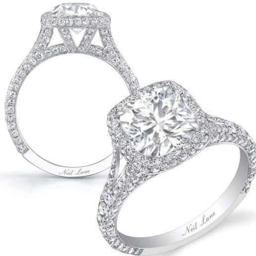
Neil Lane 3.15 carat cushion shaped diamond ring with halo setting and split link band. Image by Neil Lane.

The ring Sean Lowe picked for Catherine Giudici during Season 17 of The Bachelor is another one of your chic cushion-cut natural diamond designs. The 3.15-carat center stone is stunning.