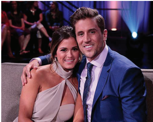
JoJo Fletcher and Jordan Rodgers sits down with Chris Harrison to talk about their engagement on 'After the Final Rose'.

It is one of the most beautiful rings I have ever made. I wanted something with Art Deco design elements. On the gallery of the ring under the stone, there is a little arch set with diamonds. I put it there so whenever she puts her hand out to type on a computer or holds her baby, she will see it and remember the proposal and the moment when the ring got slipped on her finger.