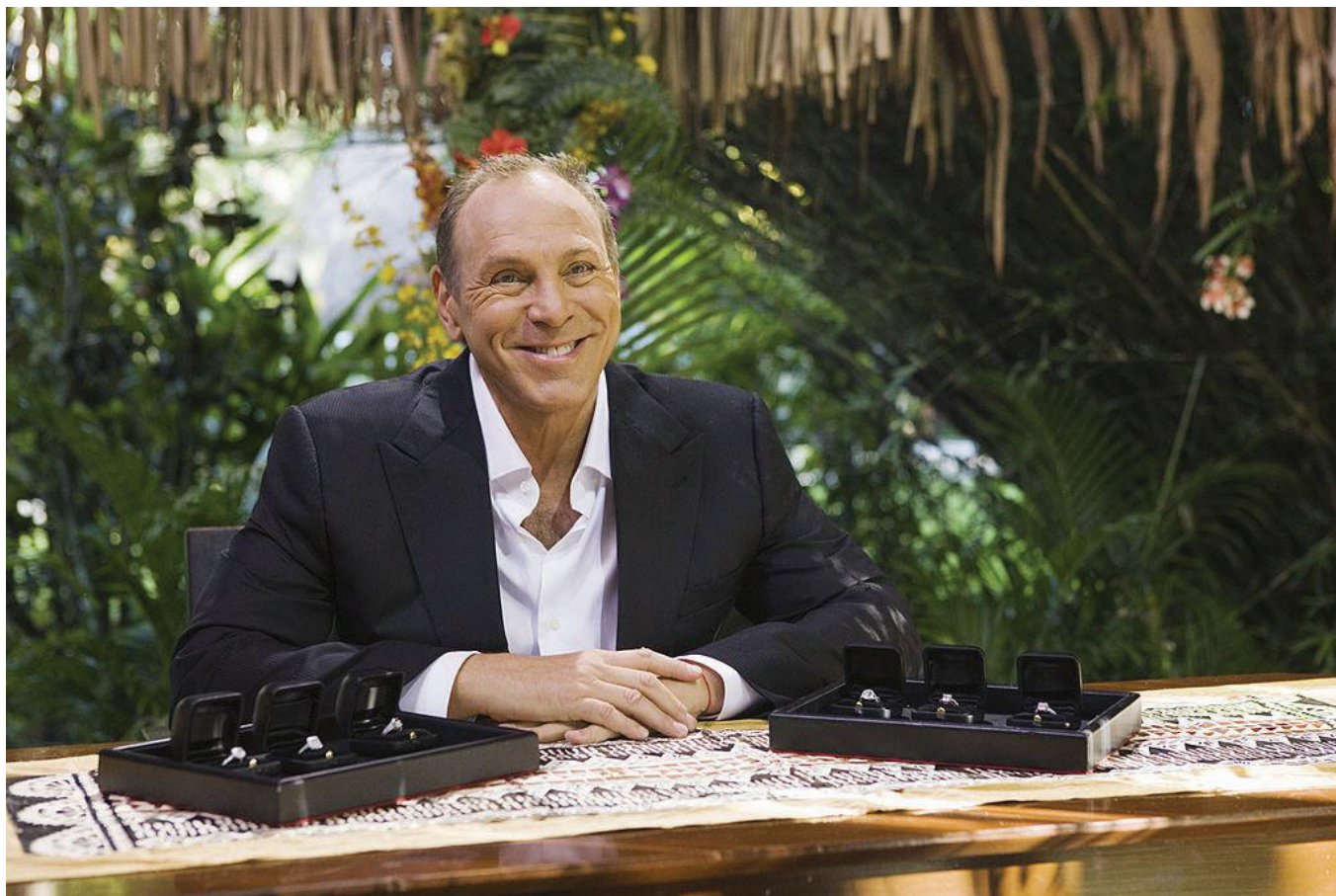
Jewelry designer Neil Lane on the the season finale of "The Bachelorette".

We talk Neil Lane diamond engagement rings with Bachelor Nation's go-to jeweler. Our exclusive conversation with the maker of 10+ years of stunning diamond rings featured on The Bachelor/Bachelorette.