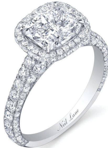
Neil Lane Cushion Cut Art Deco Engagement Ring.

Let's talk about some of the specific diamond rings from the show. Tell us about the cushion-cut natural diamond engagement ring J.P. Rosenbaum gave Ashley Hebert on Season 7 of The Bachelorette .